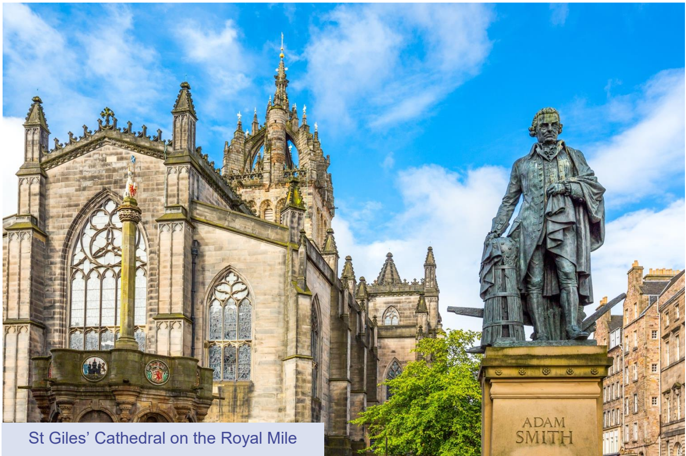
St Giles' Cathedral on the Royal Mile

Your first day is spent in the company of a local guide on a full day private walking tour that includes lunch and entry to Edinburgh Castle. You will take in the city's classics including the Royal Mile and St Giles Cathedral as well as hidden secrets known only to local experts. The route varies according to each guide's passions and will provide a great overview and introduction Scotland's capital.