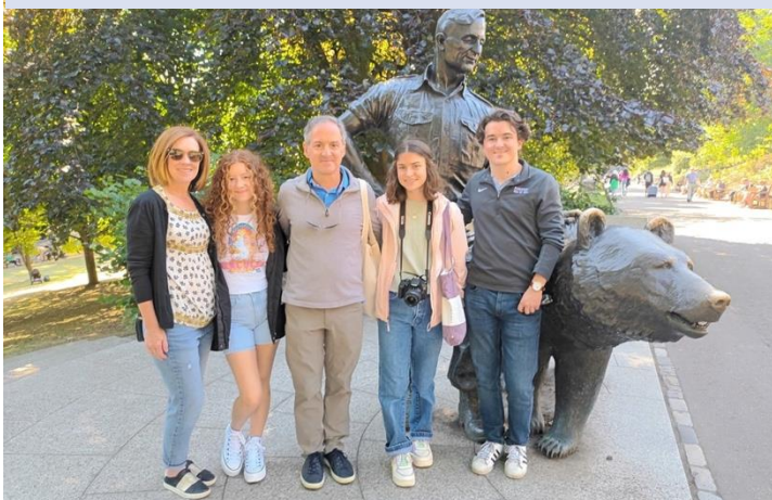
Enjoying a guided tour of the city