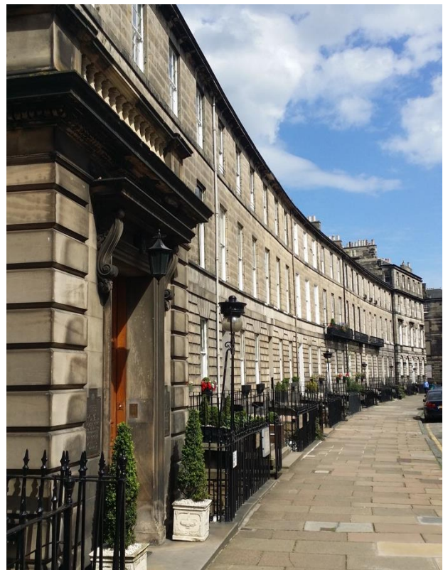
Accommodation in the Georgian New Town