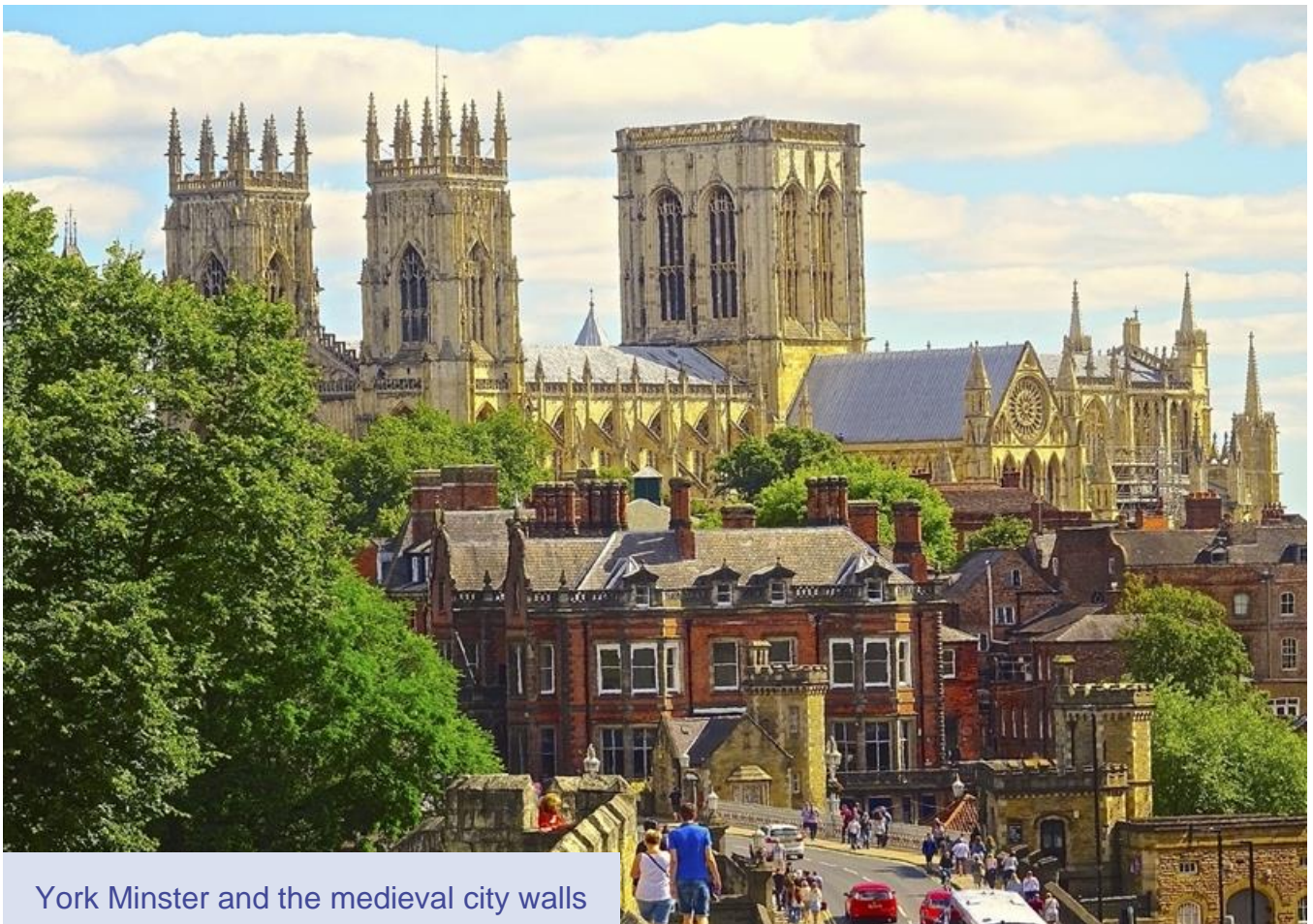
York Minster and the medieval city walls

York's fascinating history stretches back 2000 years to its Roman origins before it became the Viking capital of England. You'll stay 4 nights at a city centre hotel, within a few hundred feet of the magnificent York Minster that can be visited using the York Pass along with many of the city's world class attractions including the National Railway Museum, Clifford's Tower and Jorvik Viking Centre. The streets are bursting with restaurants, eateries and shops, including the legendary Betty's Café Tea Rooms and The Shambles said to be the best-preserved medieval street in the world.