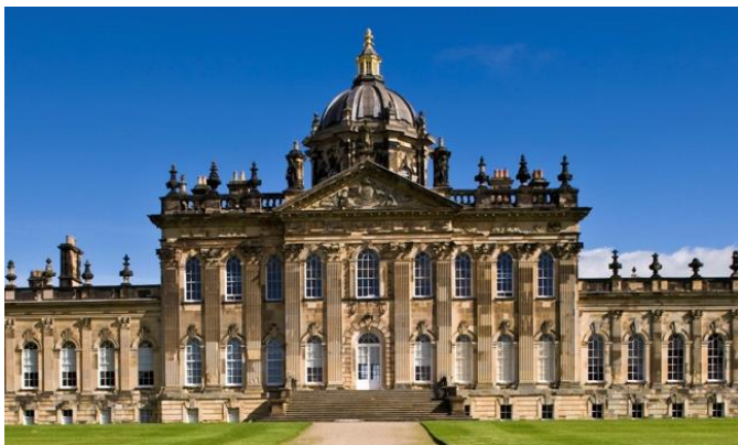
Castle Howard, a day trip from York by bus